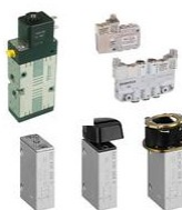
General Purpose Valves