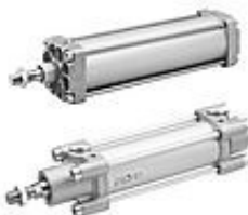
Pneumatic & Hydraulic Cylinders